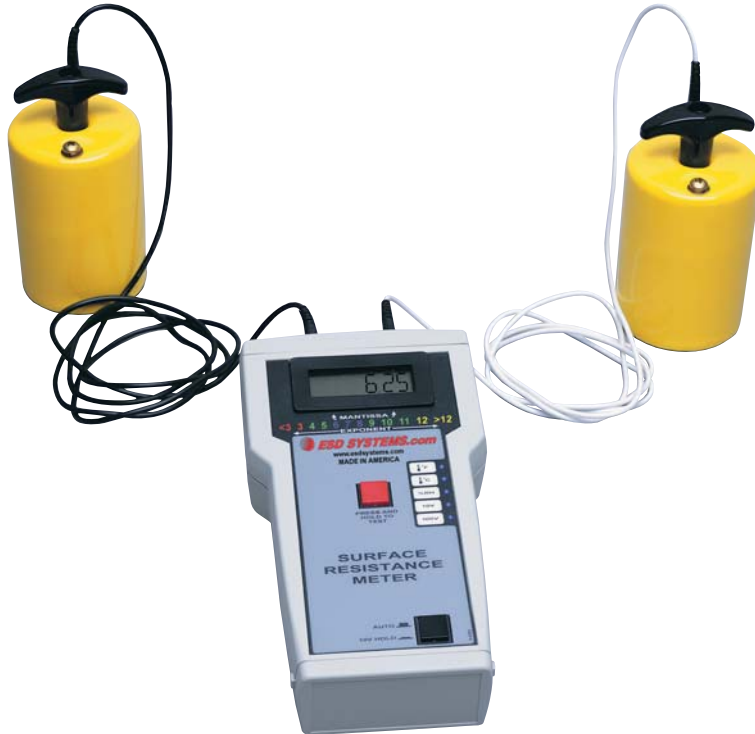
Figure 1. Item 41290 Surface Resistance Test Kit