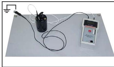
Figure 3. Setting up for RTG testing.

If measurement is outside acceptable limits, clean surface and retest to determine if cause of failure is insulative dirt layer or the ESD protective product. Note: Use an ESD cleaner containing no insulative silicone (i.e. Reztore™ Antistatic Surface and Mat Cleaner).