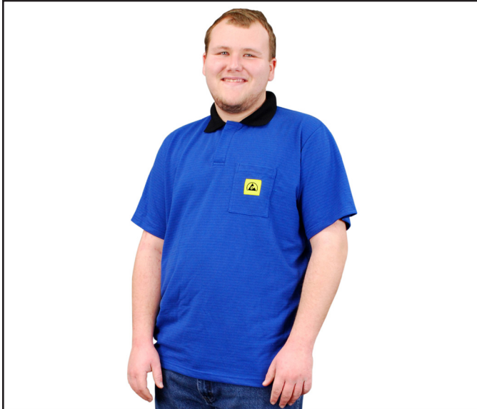
Figure 1. Charleswater ESD Polo Shirt