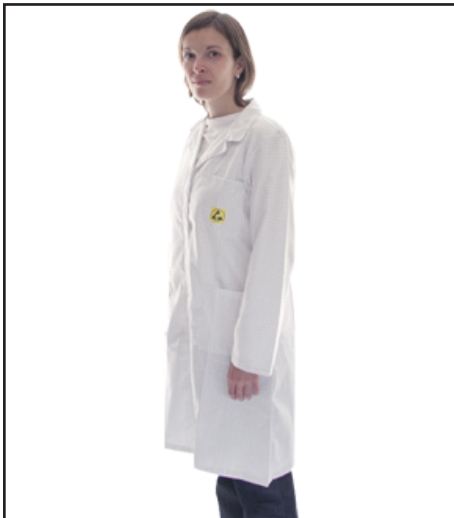
Figure 1. Charleswater Female ESD Lab Coat

Charleswater ESD Lab Coats meet the required limit Rp-p less than 1 \times 10^{12} ohms in EN 61340-5-1 tested per ANSI/ESD STM2.1 as noted in Table 3 EPA requirement of EN 61340-5-1 Edition 1.0 2007-08.