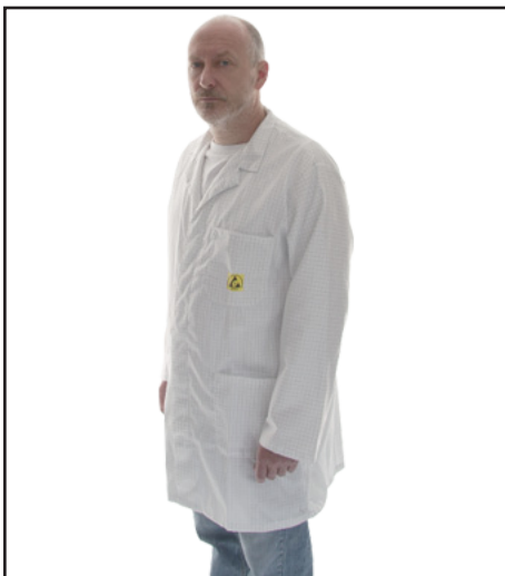
Figure 2. Charleswater Male ESD Lab Coat