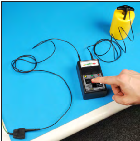
Figure 3. Using the test leads and one 5 pound electrode to measure Rg

CAUTION: If there is a current limiting resistor in the worksurface and the worksurface resistance is lower, the measurement will primarily be the resistance of the resistor. It is recommended to measure Rp-p particularly if the material color is black.