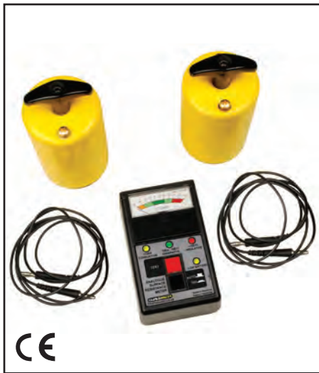
Figure 1. Charleswater 99111 Analogue Surface Resistance Test Kit