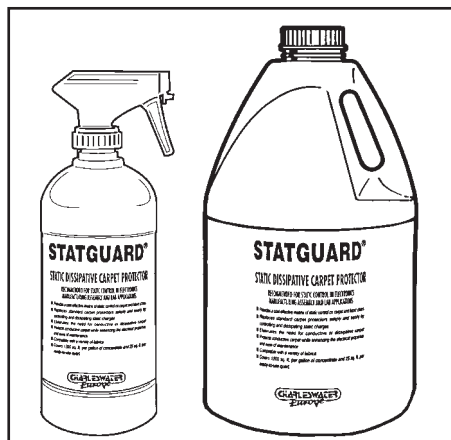
Figure 1. Statguard® Carpet Protector 70995 1 litre trigger spray ready to use for dry application 70996 3.8 litres concentrate