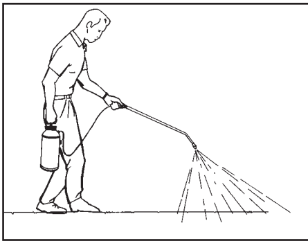
Figure 2. Compressed air sprayer in use.

Note: It is extremely important to obtain uniform coverage. Uneven application may result in uneven soil protection.