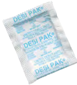
48880 & 48883