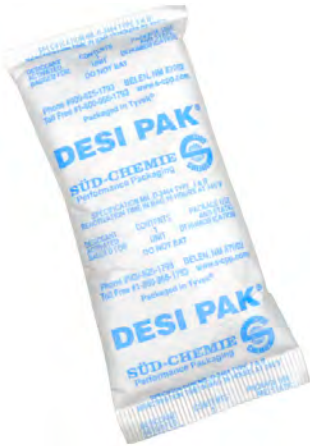
48887 & 48888

In order to provide a complete moisture barrier packaging assembly, desiccant must be inserted into the bag, prior to having the bag vacuum sealed. The recommended amount of desiccant is dependent on the interior surface area of the bag to be used. Figure 4 is a reference table indicating recommended minimum amounts of desiccant that should be used with Moisture Barrier Bags.